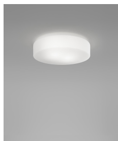
SOGNO PP 30