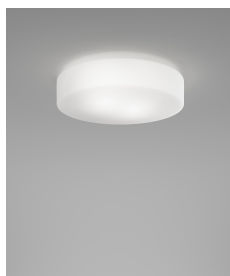
SOGNO PP 42