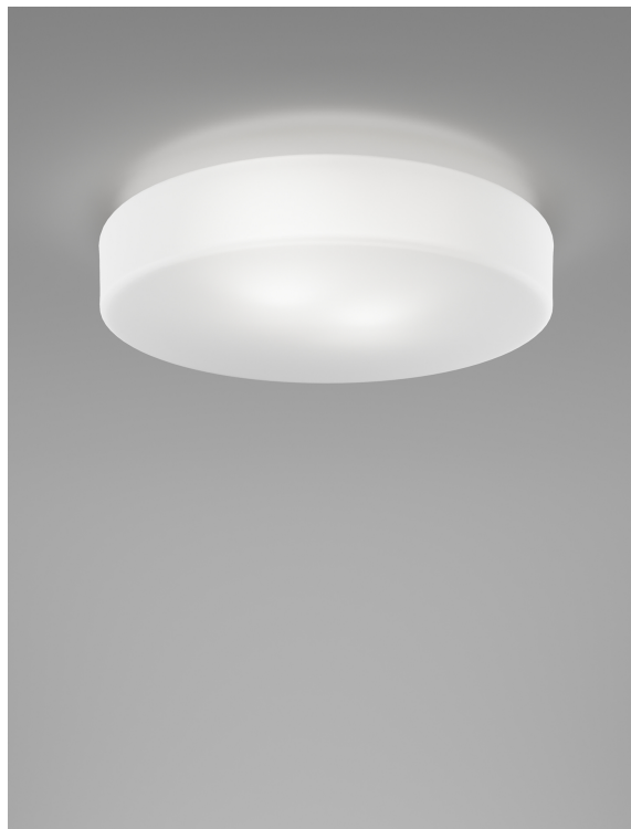
SOGNO PP 55 BCST BC E27 CE